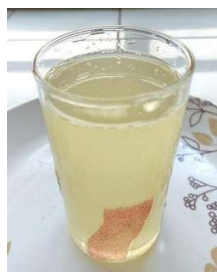
Figure 4: Blended Squash Sample S2